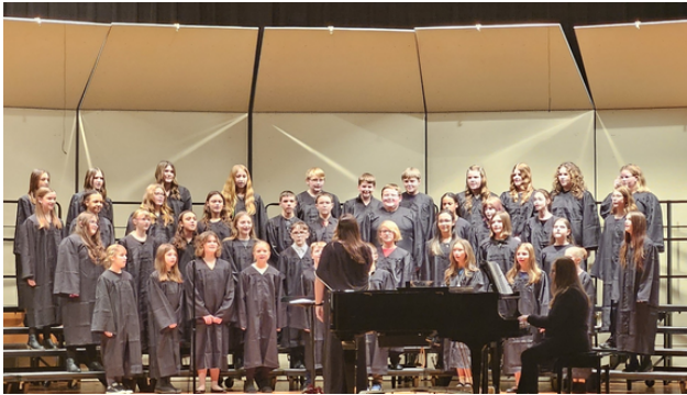
6th Grade Choir

The 6th and 7th Grade Choirs had a very successful concert on December 17 and are looking forward to more musical moments together this spring.