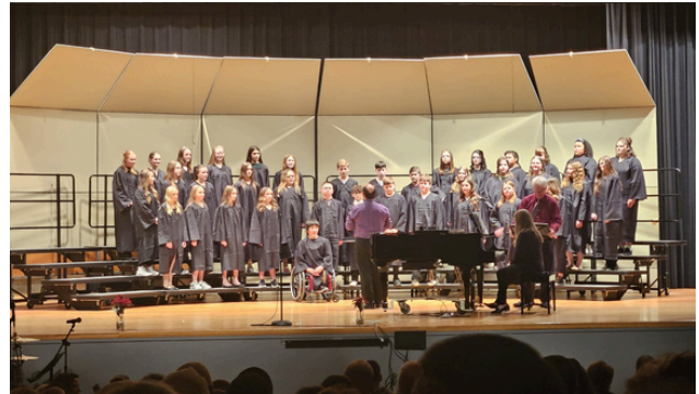
7th Grade Choir